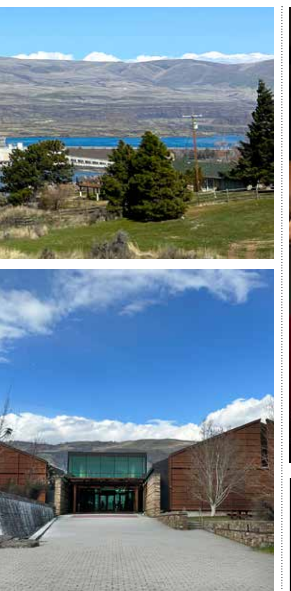
The Discovery Center